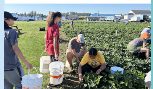
Students from Our Lady Queen of Heaven harvesting green beans at Christ the King Farm

Through farm work, groups practice solidarity, build a connection with creation, and support farms with a better vision of agriculture.