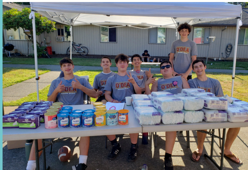
Group members from O'Dea High School helping distribute hygiene products