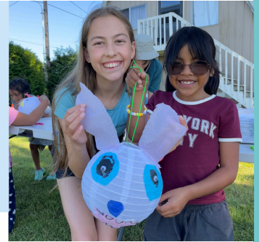
Friends making a Stitch lantern together!

Through community meals and activities, everyone is able to participate in child-like joy and build a culture of encounter.