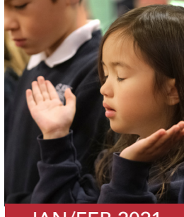
JAN/FEB 2021 Dedicated to Excellence: Catholic Schools