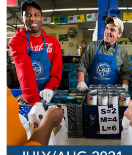
JULY/AUG 2021 Catholic Owned Businesses