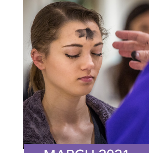
MARCH 2021 Lent & Easter