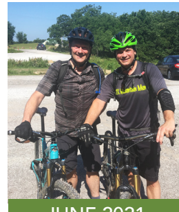
JUNE 2021 Vocations: Ordinations, Jubilarians & Parish Summer Mass Schedule