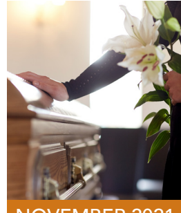
NOVEMBER 2021 End of Life