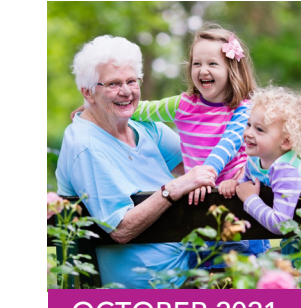
OCTOBER 2021 Senior Vitality