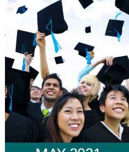
MAY 2021 Graduation: Stepping into the Future