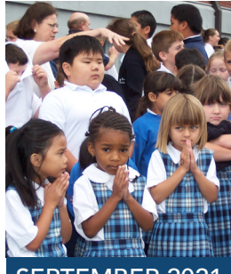
SEPTEMBER 2021 Your Story Begins Here: Back to School