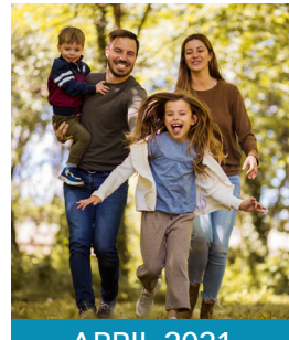
APRIL 2021 Healthy Living