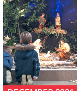
DECEMBER 2021 Advent & Christmas